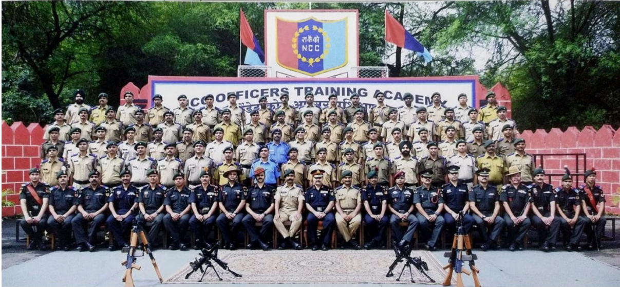
Group Photo with commissioned officers

COURSE PRCN SD-171, DC-43, NAVY-06 & AF-19 GP-II PERIOD 13 AUG 22 TO 22 OCT 2022 (ARJUN COY)