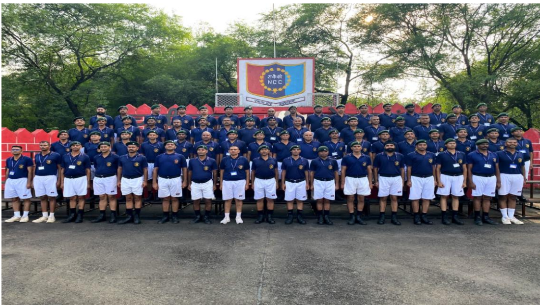
Sports Competition Group Photo